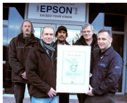
Epson Telford's project members with the award certificate